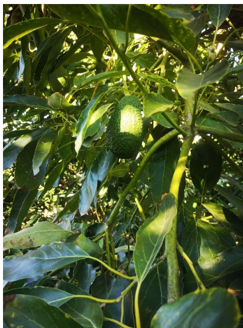
Row of avocado trees and close-up image of an avocado at Tropical Concept.